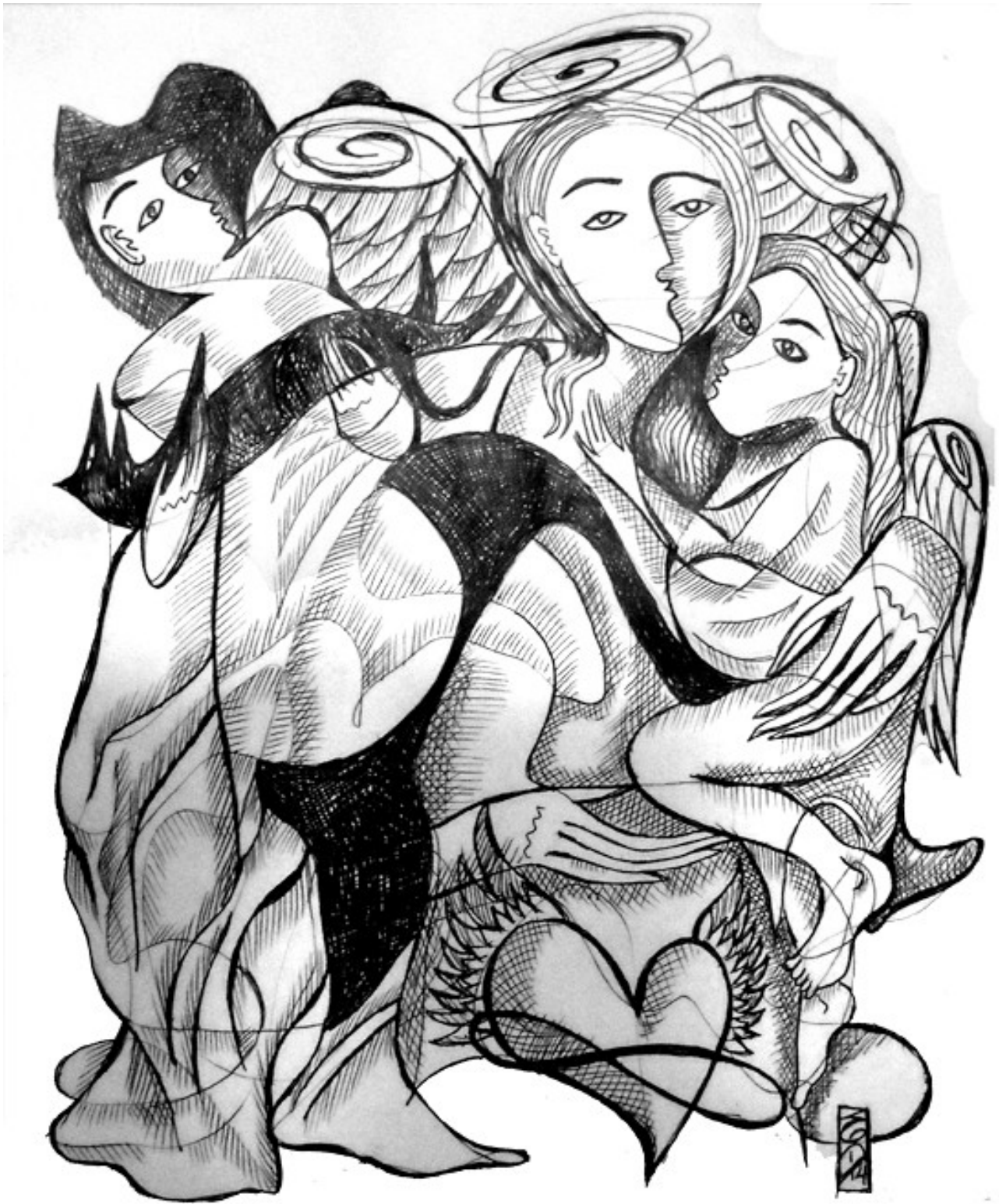
Intuitive Drawing/Reading #30: Choosing the Light, 8.5 x 11, Ballpoint Pen on Paper

"The Significator is an Angel who holds her female "child" angel in her arms on her left side (left-intuition).