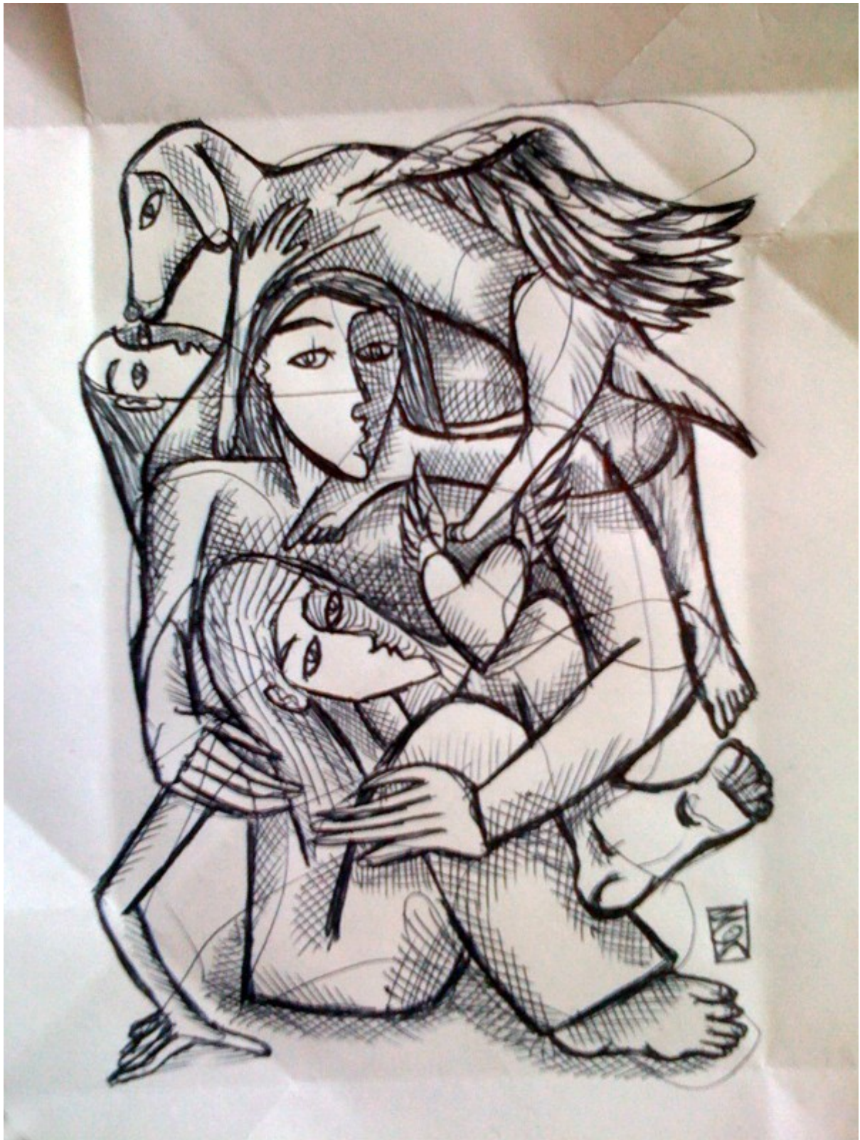
Drawing/Reading #36 4" X 6", Ballpoint Pen on Origami Fold Paper, (Facebook Competition Winner)

The picture shows 3 androgynous figures and a Dog/Angel and the Holy Spirit (heart with wings). The Dog embraces the human. The human embraces the Dog. The central figure is both the giver and the receiver.